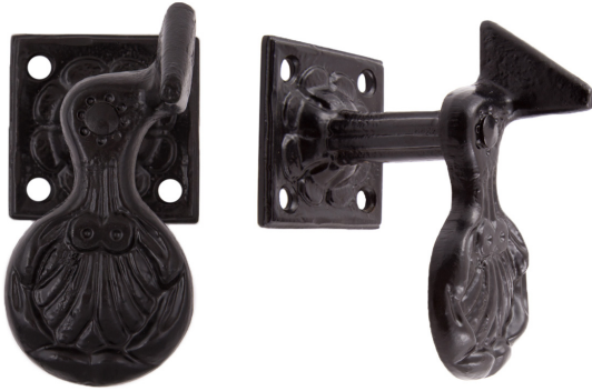
Cast Iron 1840's