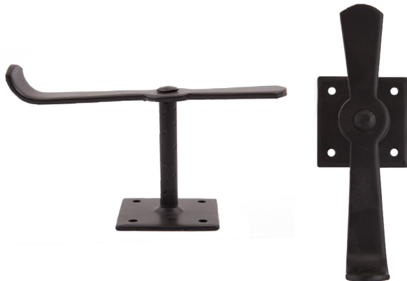
1700's Hand Wrought