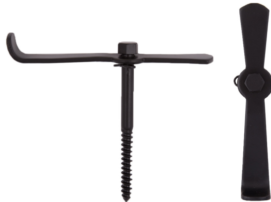
1700's Hand Wrought