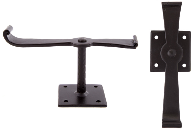
1700's Hand Wrought