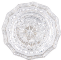
Glass pg. 7C