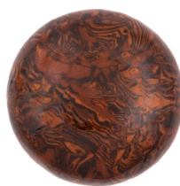
Ceramic pg. 7B