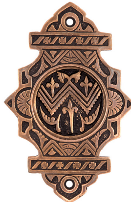
Hand Antiqued Bronze