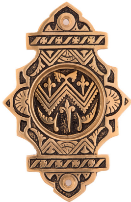
Unlacquered Polished Bronze