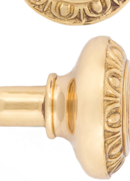
Set includes pair of doorknobs, set screws, 4 in. spindle, and washers.