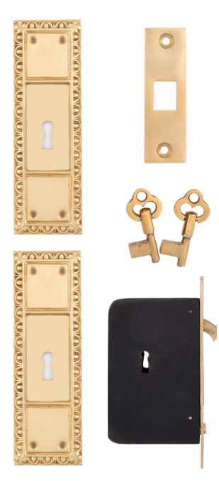
Set as shown. Minimal door thickness 1 3/4"