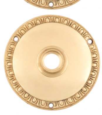
Sold by the pair, compatible with pre-bored doors.